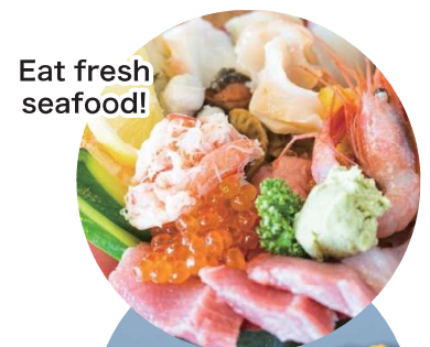
Eat fresh seafood!