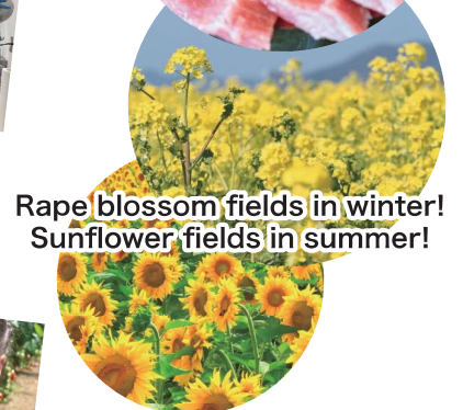
Rape blossom fields in winter! Sunflower fields in summer!