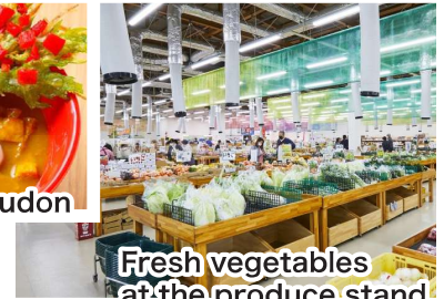
Fresh vegetables at the produce stand