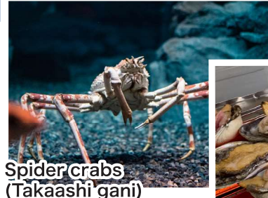
Spider crabs (Takaashi gani)

47-1 Asaoka, Hiroishi-cho, Gamagori City Visitors can experience cooking and eating the world's largest crab, the spider crab (Takaashi gani). Eat giant clams, a local specialty. Choose from a wide variety of seafood souvenirs.