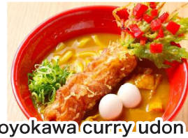
Toyokawa curry udon noodles

113-2 Ichinosawa, Higashinanane-cho, Toyohashi City One of the largest rest areas in Aichi Prefecture. Buy local products as souvenirs and enjoy local food such as Toyohashi curry udon noodles.