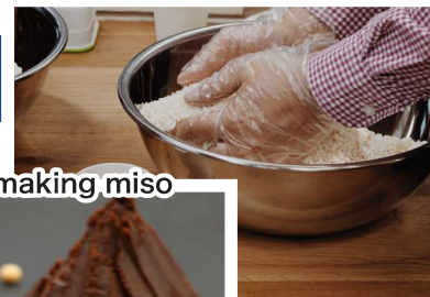
Experience making miso