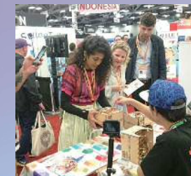
Exhibit at SXSW

In September 2019, we concluded a "Memorandum of Understanding on Cooperation in the field of Startups Support" with NUS. We will cooperate in areas such as mutual exchange of startups, business support, and entrepreneurship education between the Aichi Prefectural Government, NUS, and NUS Enterprise, which is the entrepreneurial arm of NUS.